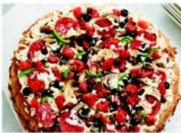
BJ's Favorite Deep Dish Pizza

Valid for dine in or take out. Not valid towards alcoholic beverages or Happy Hour specials. Please do not distribute flyers on-site during the event. Flyers must be printed and presented to the server.