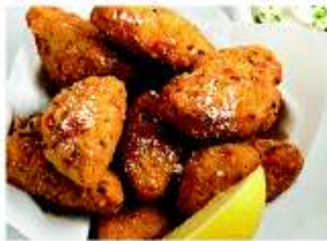
Crispy Fried Artichokes