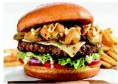
Crispy Jalapeño Burger